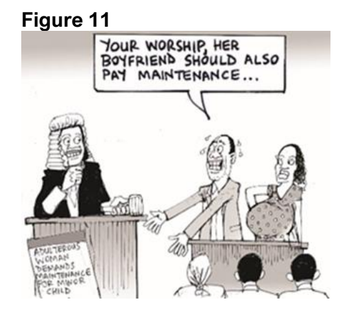
TM THE FATHER OF THE CHILD